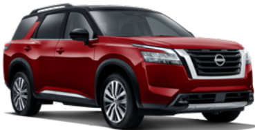
Scarlet Ember with black roof#~