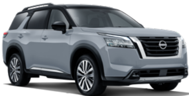
Boulder Grey with black roof#~