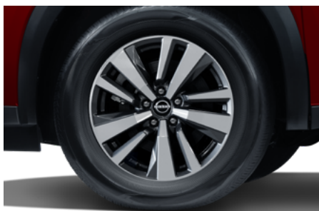
18" machine finished alloy wheel Standard on TI.