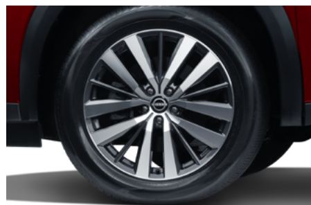
20" machine finished alloy wheel Standard on TI-L.