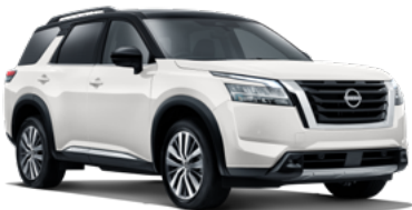
Ivory Pearl with black roof#~