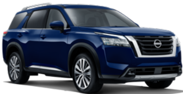
Deep Ocean Blue Pearl#