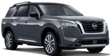
Gun Metallic with black roof#~