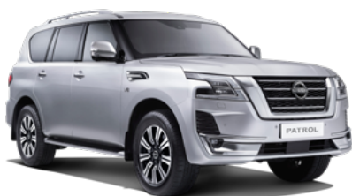
Brilliant Silver (K23)