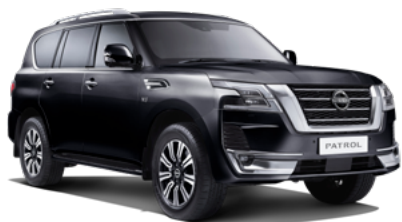
Black Obsidian (KH3)*