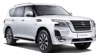
Moonstone White (QAC)*

In some cases, the printed colours may vary from the actual paint colours.