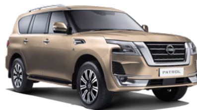
Champagne Quartz (HAG)*