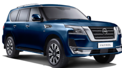
Hermosa Blue (BW5)*