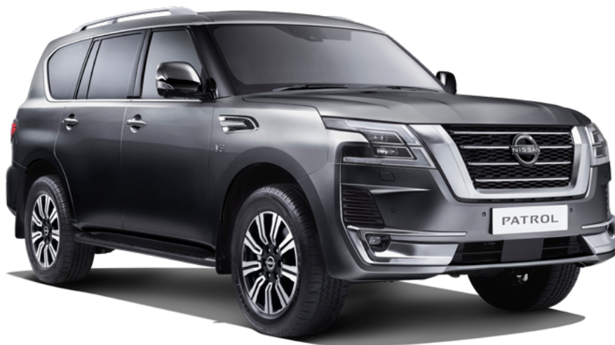
Gun Metallic (KAD)