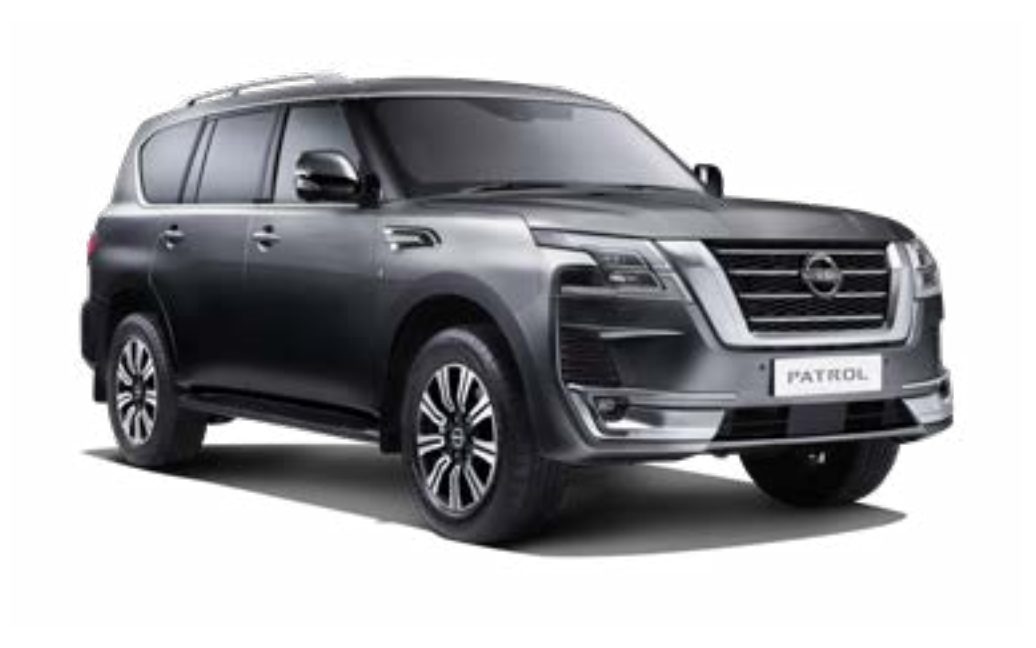
Gun Metallic (KAD)