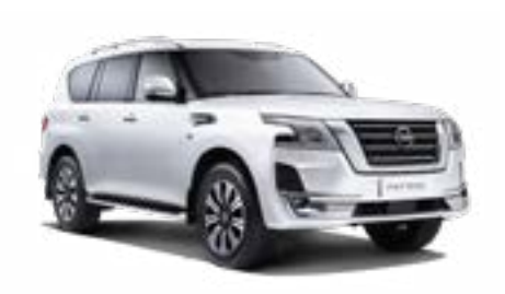
Moonstone White (QAC)*