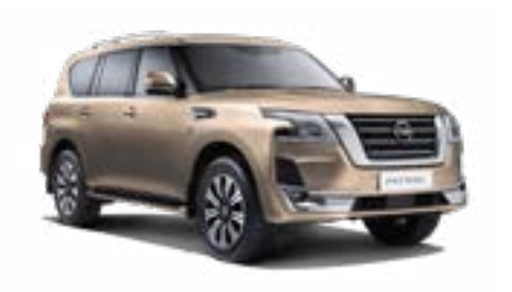
Champagne Quartz (HAG)™