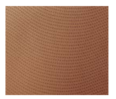
Interior light tan leather accented seat trim<sup>†</sup> (forward order only)

*Vehicle towing capacity is subject to towbar/towball capacity and design. Towing capacity may be reduced if a non genuine Nissan towbar is fitted. Please refer to the Genuine accessory brochure for towbar capacity information.