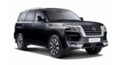
Black Obsidian (KH3)*