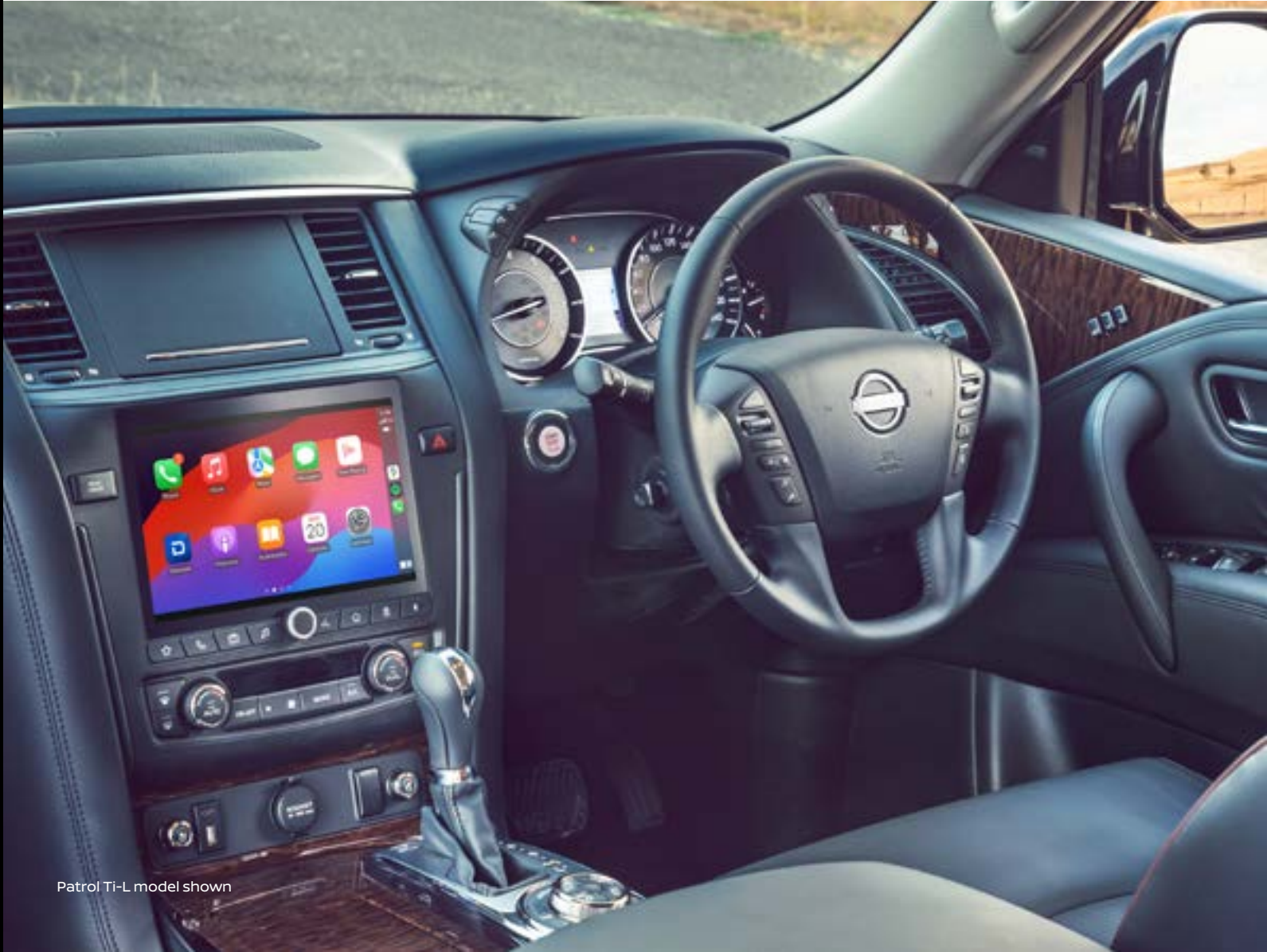
Patrol Ti-L model shown

Welcome to the new generation Patrol infotainment system. This accessory system has been locally designed and developed by Directed Technologies and comes with a range of features to enhance your journey.