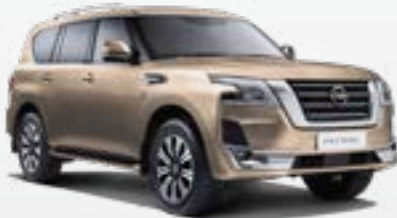
Champagne Quartz (HAG)*