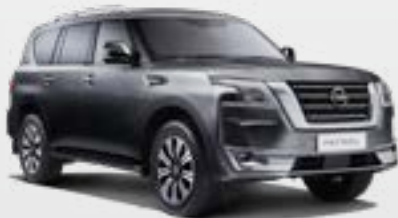
Gun Metallic (KAD)