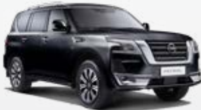
Black Obsidian (KH3)*