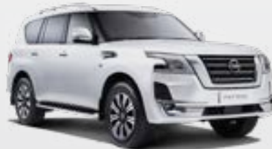
Moonstone White (QAC)*