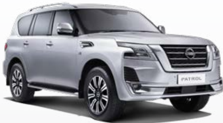
Brilliant Silver (K23)*