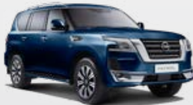
Hermosa Blue (BW5)*