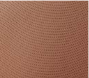
Interior light tan leather accented seat trim † (forward order only)

Minor trim variations may occur from time to time. † Leather accented features and upholstery may contain synthetic material.