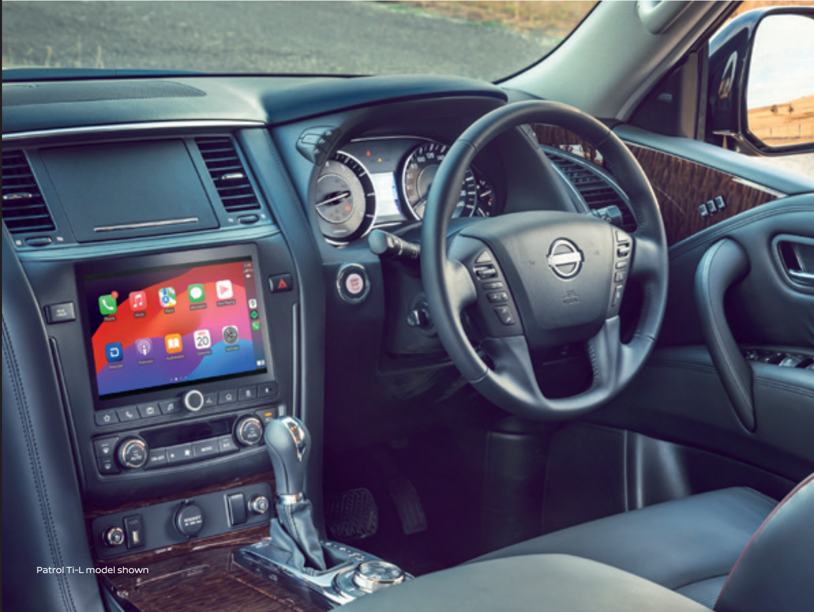
Patrol Ti-L model shown

Welcome to the new generation Patrol infotainment system. This accessory system has been locally designed and developed by Directed Technologies and comes with a range of features to enhance your journey.