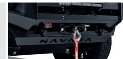
Winch & Winch Fitting Kit