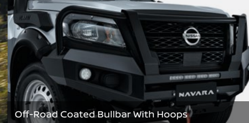
Off-Road Coated Bullbar With Hoops

NISSAN GENUINE ACCESSORIES Complete Confidence