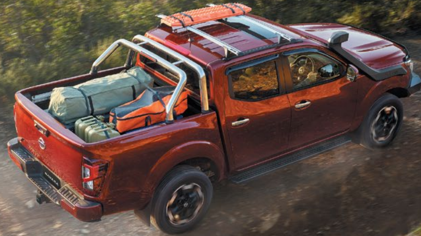
Navara Dual Cab

NISSAN GENUINE ACCESSORIES Complete Confidence