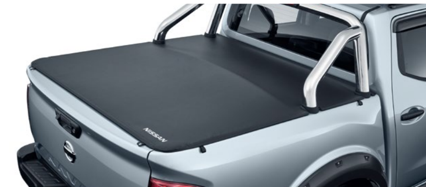
Soft Tonneau Cover