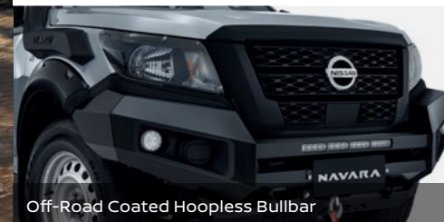
Off-Road Coated Hoopless Bullbar