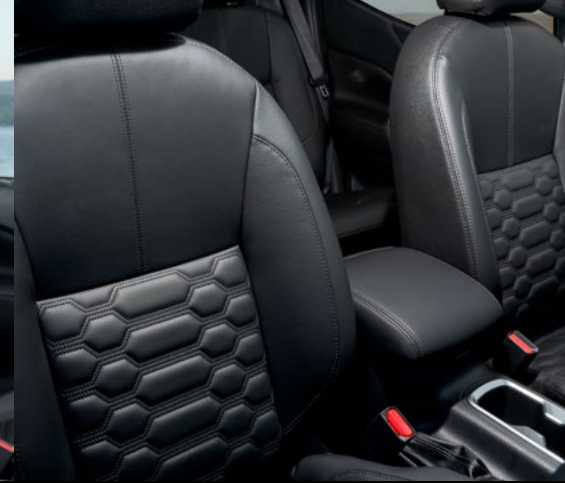
OPTIONAL LEATHER-ACCENTED SEAT TRIM - ST-X GRADES †