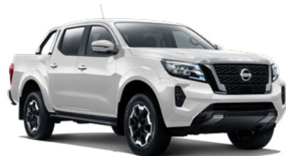
White Pearl †*