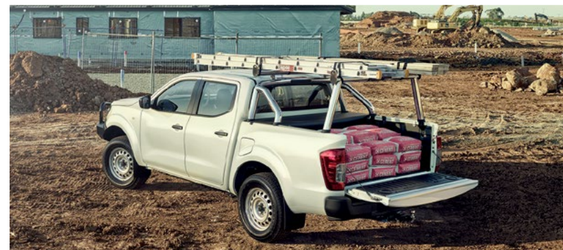
Ladder Racks (Front & Rear)

Nissan Genuine Accessories keep your vehicle complete and help maintain its resale value.