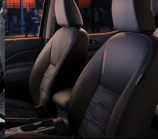
LEATHER-ACCENTED PRO-4X SEATS #

A complete ownership experience to help you get the most out of your Nissan. It includes the following: