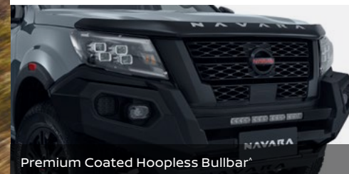
Premium Coated Hoopless Bullbar*