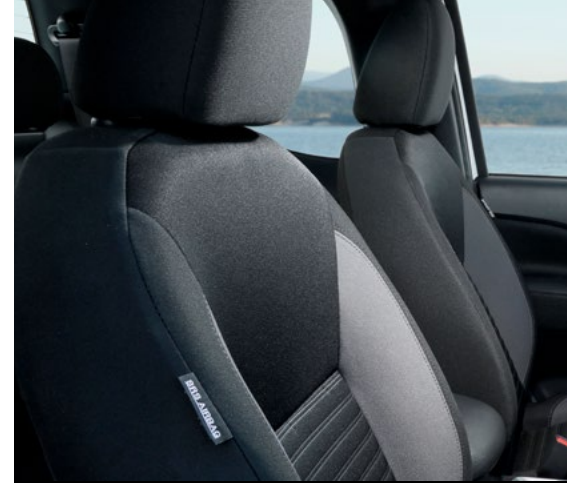
CLOTH SEAT TRIM - SL & ST GRADES