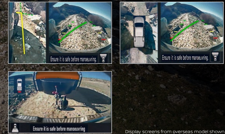
Display screens from overseas model shown.

Trailer Hook-up Having a 360-degree view 3 comes in especially handy when connecting to a trailer to help you place your Navara perfectly. It is also great when negotiating a tight parking spot.