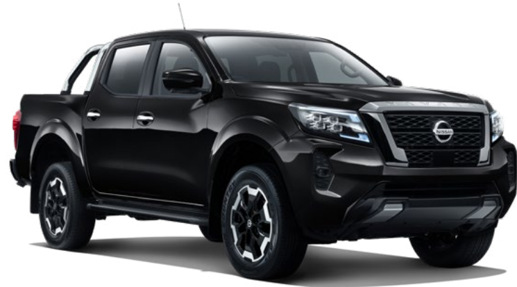
Black Star †