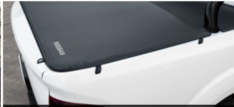
Soft Tonneau Cover