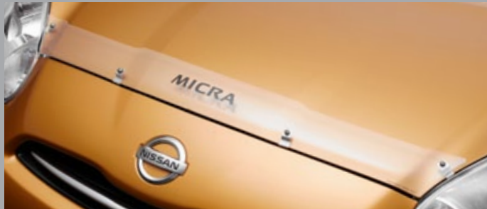
Bonnet Protector (Clear)