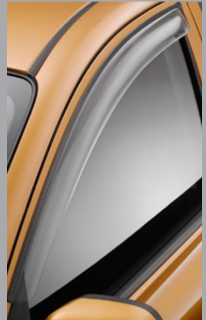
Weathershield, Slimline (LH)