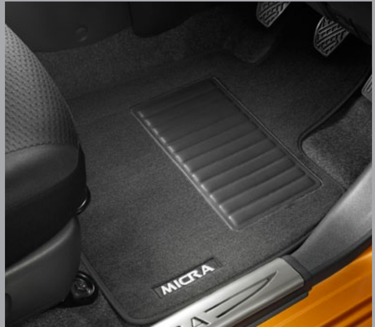
Carpet Floor Mats (Front & Rear)