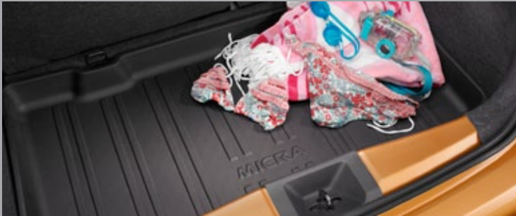
Rear Protection Tray