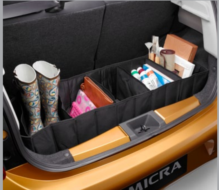
Boot Storage Bag (6 Compartment)