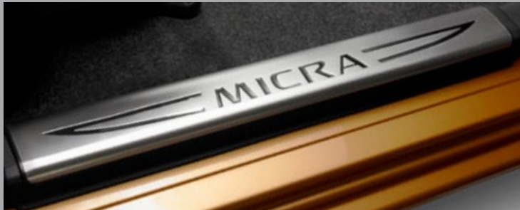
Kick Plate (Front displayed)

Micra ST accessorised with: Bonnet Protector (Smoked), Headlamp Protectors, Roof Bars, Weathershields (Slimline), Roof Spoiler, Exhaust Finisher and Rear Park Assist.