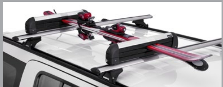
Ski/Snowboard Carrier 1