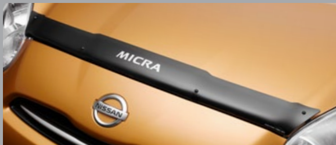
Bonnet Protector (Smoked)