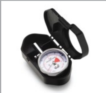
Tyre Pressure Gauge (Analogue)

Items featured with accessories, not included.